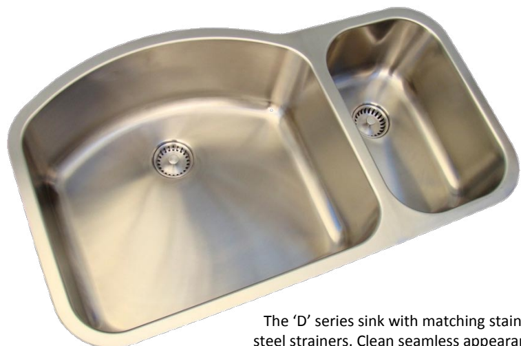
The ‘D’ series sink with matching stainless steel strainers. Clean seamless appearance.

With a traditional sink, drain kits are purchased separately. A quality drain kit for both sides of the sink can easily cost up to $100. The Affluence ™ Seamless Sink is an integrated design that includes the stainless steel strainer baskets and drain/disposer under-mount hardware for significant cost savings. The strainer baskets are made of the same 304 stainless steel and finish as the sink giving the entire assembly an integrated and coordinated appearance. “We have taken the sink, strainer baskets, under-mount fittings and disposer splash