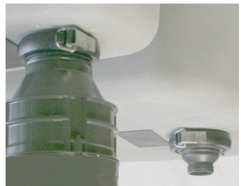
6. Attach clamp.

* For added leverage, place the base of the disposal in the palm of your hand and put that elbow on the floor of the cabinet. The other hand guides the throat and lip into the rubber mounting seal.