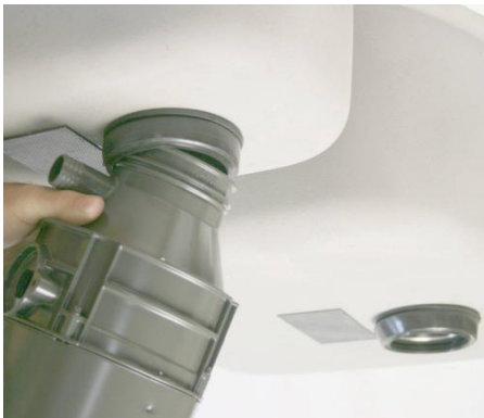
3. Slip the lip into the rubber mount*.