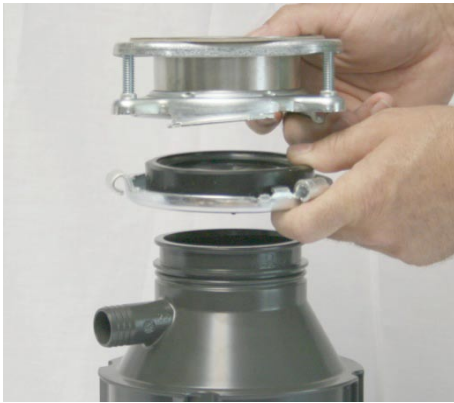
1. Remove the bracket and seal,

Be sure electrical wiring to disposer is disconnected from power. Be sure circuit breakers are turned off before installing. And be sure to wear safety glasses.