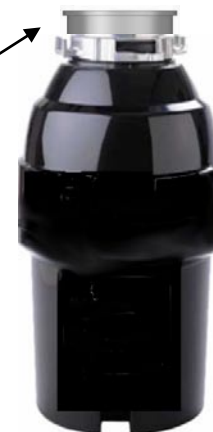
Adapter installed. Notice lip.

The lip slips into the Seamless Sink's mounting seal and is attached with a clamp as above.