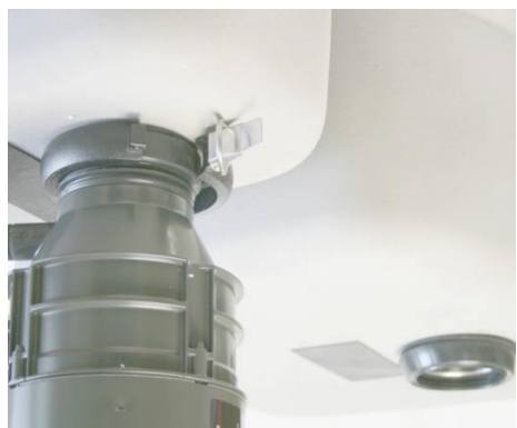
4. Support disposer with one hand and attach clamp.