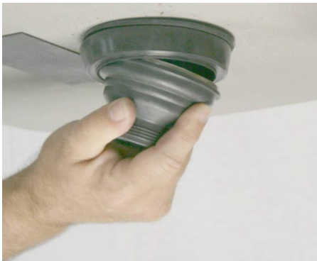
5. Slip the strainer base into the rubber mount.