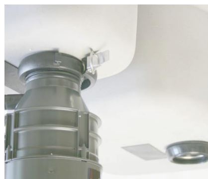
Support disposer with one hand and attach clamp.

* Affluence™ SeamlessSink mounting seal is not designed to fit Batch Feed and Kitchen Aid disposers.