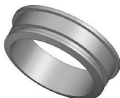
Notice the adapter's lip.

If adapter is needed, contact us and we will ship at no charge.