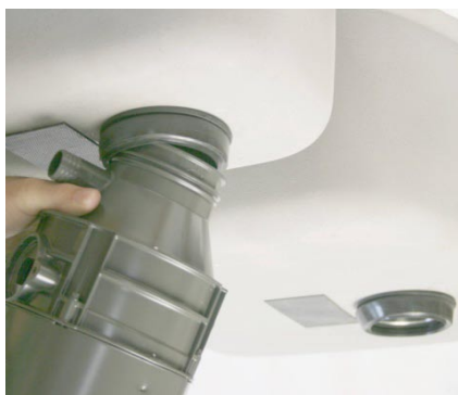
Slip the lip into the the rubber mount.